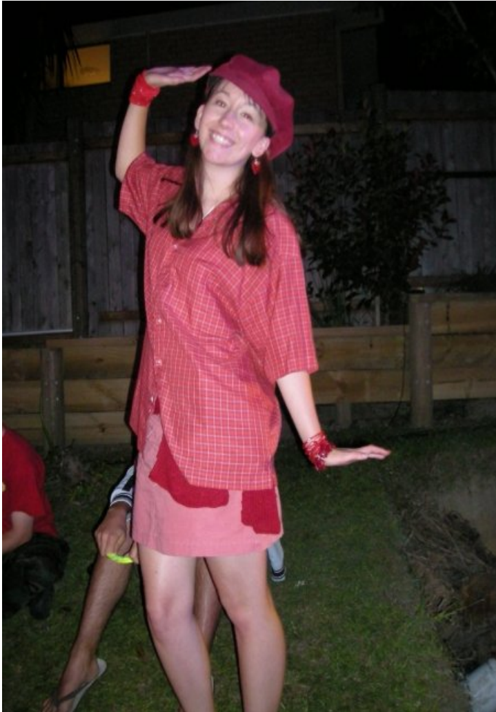
Me dressed as

One of my friend's threw a Rubik's Cube New Year's Eve party but it could suit a 21st just as well. What is a Rubik's Cube party? It's a party where you have to dress up in different colours of the Rubik's cube (red, white, yellow, green, blue, orange) and by midnight you have to have swapped with other people until you're dressed all in one colour. I decided my colour was going to be red.